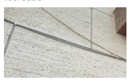
▲ Miniflex running in direct sunlight without the need for microduct