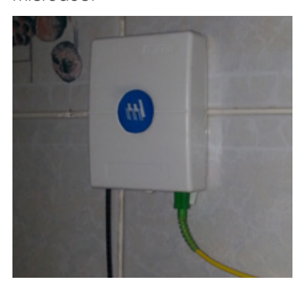
▲ Efficient and visually pleasing indoor termination to the customer premises wall box